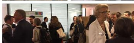
The CleanTech Open France semi-final