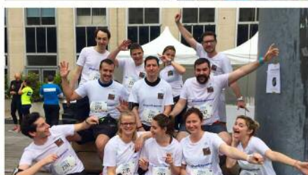
Exponens participated in Les Foulées de l'Immobilier on June 19.