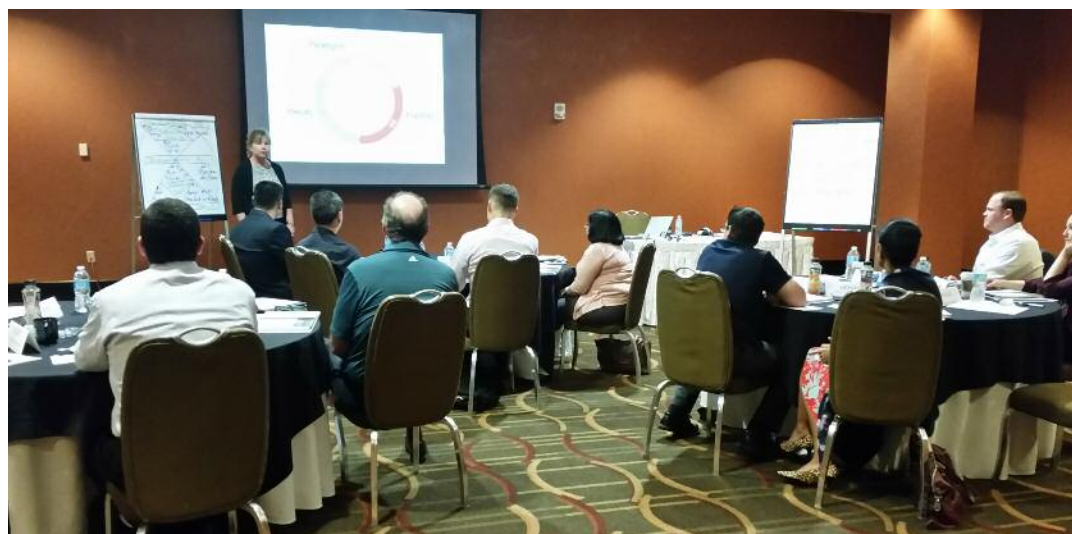
The first session of BKR's 2016-2017 Leadership Institute was held at the Hilton St. Louis at the Ballpark in St. Louis, Missouri, on August 3-5.

For more information about the upcoming sessions of the BKR Leadership Institute, visit http://bkr.com/bkr-upcoming-events.php .