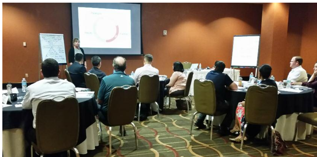
The first session of BKR's 2016-2017 Leadership Institute was held at the Hilton St. Louis at the Ballpark in St. Louis, Missouri, on August 3-5.

For more information about the upcoming sessions of the BKR Leadership Institute, visit http://bkr.com/bkr-upcoming-events.php .