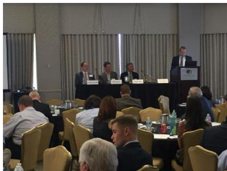
Briggs & Veselka Co.'s annual event, B&V Insights