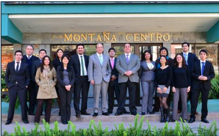
The Ossandón Auditores Consultores team