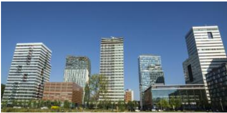
Molade Business Support B.V.

Molade Trust Management B.V. is proud to announce the birth of a sister company, Molade Business Support B.V. ("MBS"), and she is doing well. MBS offers a wide range of business support services to foreign companies starting up in the Netherlands, including incorporation, financial services, payroll services, etc. MBS is a one-stop shop operation securing a hassle-free transition for the clients' business in the Netherlands. Check out her birthday card at: http://www.businesssupport.amsterdam .